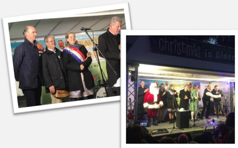
Oberursel's Fountain Queen visited Aldershot to take part in switching on the Christmas lights. November 2018