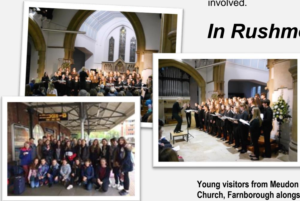
Young visitors from Meudon performed in St Peter's Church, Farnborough alongside choirs from Farnborough Sixth Form College and HawleyHurst School. April 2018