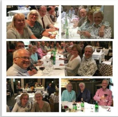
Twinning Association of Rushmoor members and friends' visit to Oberursel. September 2018